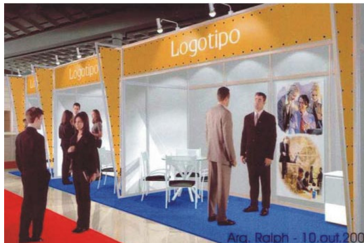
Fig. 3 – Front perspective of the stands offered to the exhibitors