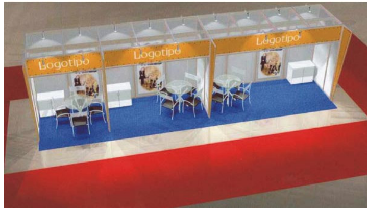
Fig. 2 – Upper perspective of the stands offered to the ISHM 2006 exhibitors